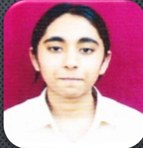
HIMANSHI 93.6 % SCIENCE