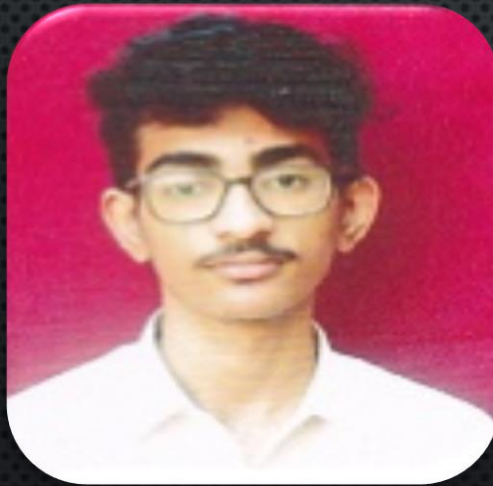
JAGAT KELA 93 % SCIENCE